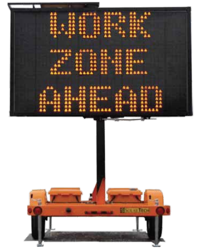
Solar Arrow Panels & Solar Variable Message Boards