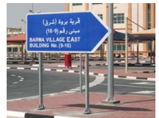
Urban Directional Signs