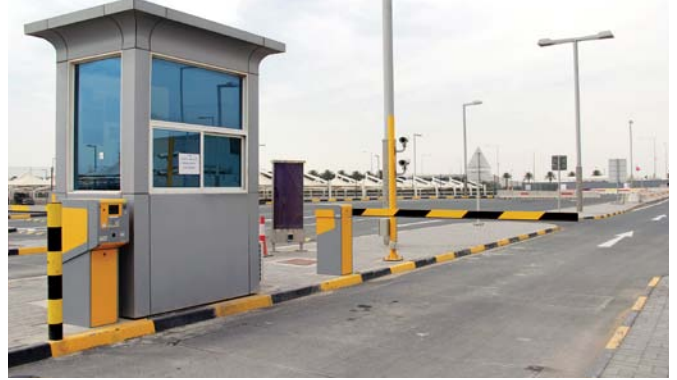
Parking Management Systems