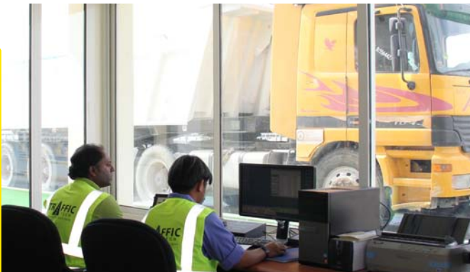
Truck Weigh Stations