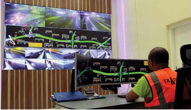
ITS & Urban Traffic Control (UTC) Systems

Traffic Tech offers full system operation & maintenance of: