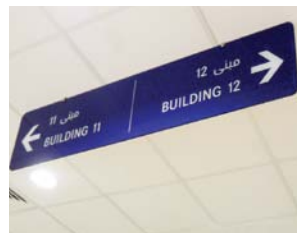
Ceiling Mounted Signs