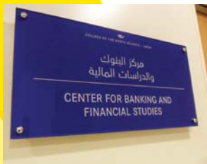
Way Finding System