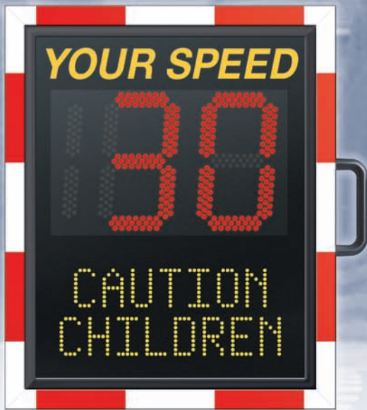
Dimensions: 63,4 x 84,4 x 18,2 cm (W x H x D)